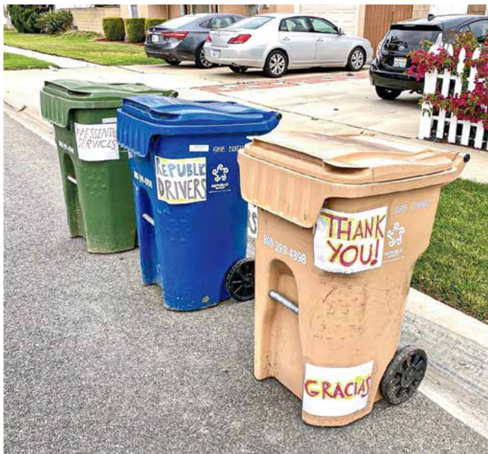
Residents showed their appreciation for our employees during the COVID-19 crisis.

If you have questions about your business or multi-family recycling programs, or if you wish to make changes or improvements, call Republic Services at 800.299.4898.