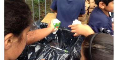
Trash can (minimum of one) with one milk crate (easily accessible from the cafeteria) for milk pouring.