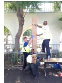
Table or desk for stacking trays.