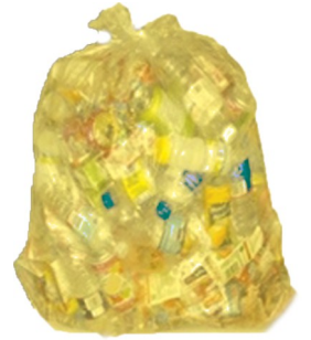
Trash can (minimum of one), clear yellow bags and black bags