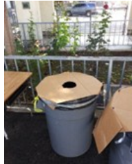
Recycle can (minimum of one), lid or piece of cardboard with holes for collection of empty milk cartons.